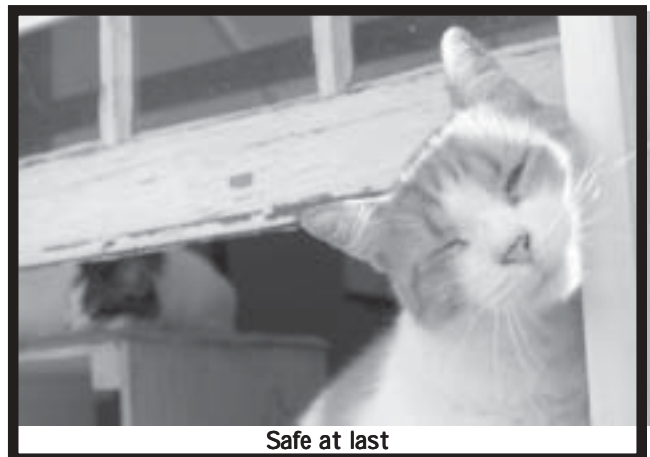
Safe at last