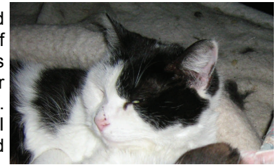
Venus taking a well-deserved nap