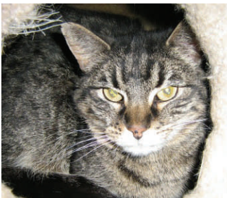
Boca 13 years old