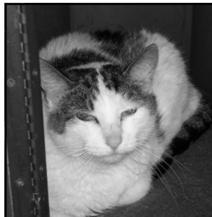
Kayla 14 years old