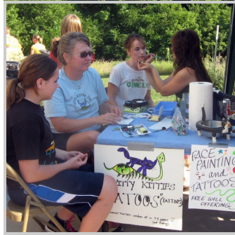
Face painting was very popular with all ages