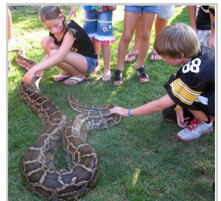
(More pictures on page 2)

Lucifer doesn't seem to mind getting so much attention -- after all, how many times do snakes get petted?