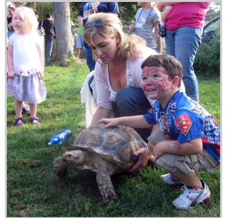
"Wow! This is neat!"