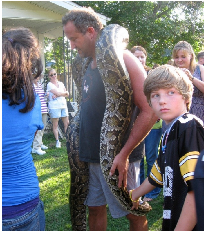
The only way to wear snakeskin -- make sure the snake is still in it!