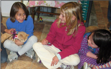
Safia, Lucy, and Sophie meet Angelina

We printed up a few very nice photos of Angelina, and each scout got to take the photo home for a couple weeks before passing it on at the next meeting. Each girl also took home a painted “Kitty Fund” can that she used to collect donations during the time she had the photo of Angelina. The girls did all kinds of things to raise money, including collecting their family’s spare change, turning in bottles and cans, asking friends and relatives for donations, and even going door to door. At each scout meeting, the girl who brought back her donations and photo got to color in a portion of a large thermometer that marked their progress. The higher it got, the closer to their goal – meeting Angelina!